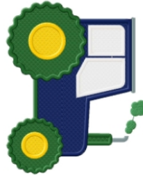
File: 5x7 tractor embroidery.jef Stitches: 33946 Size: 127.4 x 158.0 mm Colors: 7 Stops: 6