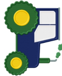
File: 6x10 tractor embroidery.jef Stitches: 48256 Size: 156.8 x 194.4 mm Colors: 7 Stops: 6

This documentation was created with Embird Plus software registered to Deanna Gunn. For more information regarding Embird Plus please visit web site at http://www.embird.com .