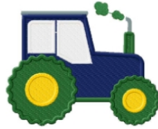
File: 4x4 tractor embroidery.jef Stitches: 15615 Size: 98.2 x 79.2 mm Colors: 7 Stops: 6